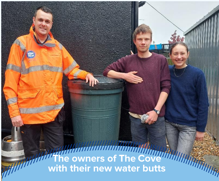
The owners of The Cove with their new water butts