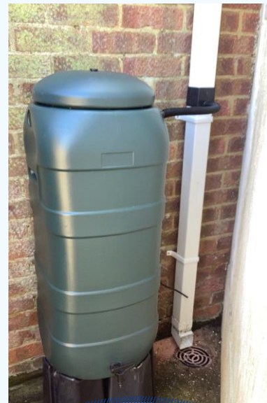
100L water butt